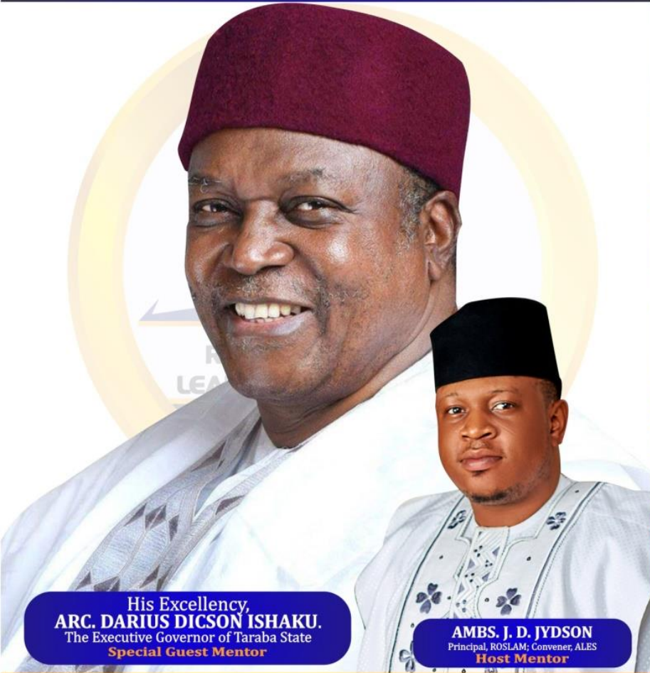
His Excellency, ARC. DARIUS DICSON ISHAKU. The Executive Governor of Taraba State Special Guest Mentor

Leadership Empowerment For Attaining Dominion Transforming Followers into Leaders and Leaders into Agents of Change Thereby Raising Leaders to Transform Nations